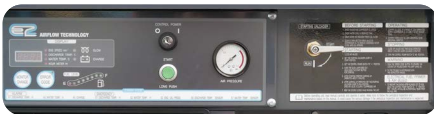
Easy to operate control panel with LED fuel gauge, digital display and clear operating instructions