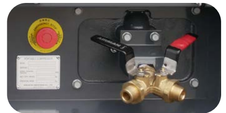
Dual air outlets