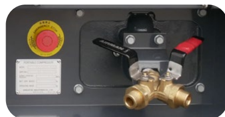
Dual air outlets