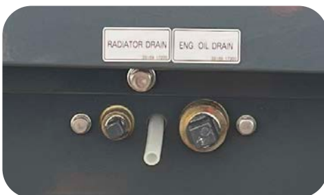
External coolant and oil drains for fast servicing