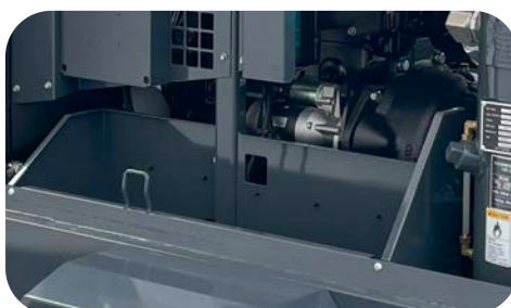
Unique internal storage compartment