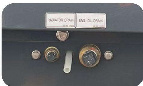
External coolant and oil drains for fast servicing