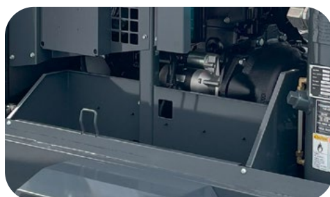
Unique internal storage compartment