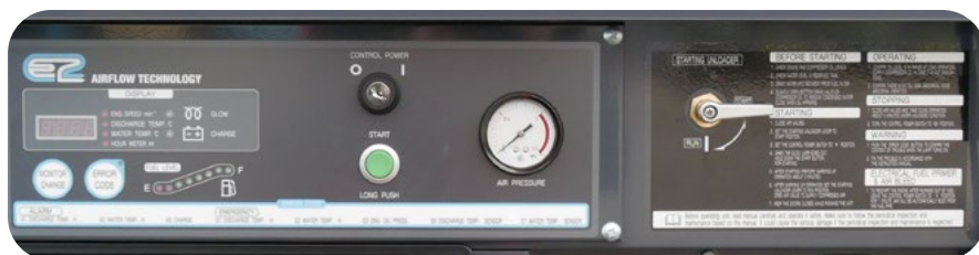
Easy to operate control panel with LED fuel gauge, digital display and clear operating instructions